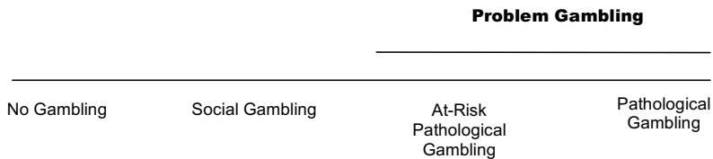
Figure 2 Gambling Continuum

Problem gambling is a term frequently used to describe a specific range of problems and negative consequences associated with gambling. The range exists along a continuum, from social gambling to at-risk pathological gambling to pathological gambling, which represents the “clinical,” or most severe, end of the spectrum (see Figure 2).